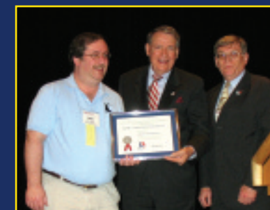
Congressman Taylor presents an award to a Haywood County company for creating new jobs through government contracts.

In March, Congressman Taylor hosted the seventh bi-annual Opportunities trade show. This regional "reverse trade show" allows small businesses the opportunity to meet contracting officers from more than 60 federal, state and local government agencies and prime contractors. Nearly 600 small business owners, mostly from North and South Carolina, attended this year—the largest crowd ever to attend an Opportunities trade show. Two businesses were awarded on the spot government contracts. Many more small businesses will be awarded contracts as a result of this trade fair.