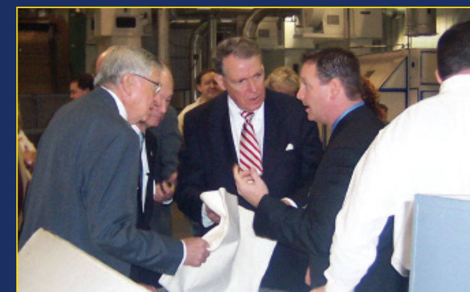
Congressman Taylor tours a local factory in an effort to better understand the needs of WNC businesses. Because of knowledge gained from meetings such as this, Taylor is able to secure much-needed federal funds and contracts for local businesses and projects.

The appropriations earmark will allow 3TEX to develop a lightweight armor to protect soldiers and vehicles from the threat of explosions. Many of the add-on armor solutions currently available add significant weight to the vehicles, which slows down performance. The armor developed by 3TEX can also be used to protect buildings. This work will also mean other companies will relocate to our region, in turn creating even more new jobs.